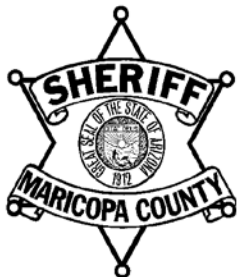
Joseph M. Arpaio, Sheriff